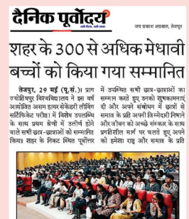
शहर के 300 से अधिक मेधावी बच्चों को किया गया सम्मानित

Pragjyotishpur University organised felicitation ceremonies in North Lakhimpur on 19 May 2024, at Tezpur and Sarthebari on 27 May 2024, at Bezera on 6 June 2024, and at Pathsala on 9 June 2024 for students who had successfully cleared their HSSLC exams. Meritorious students from across schools in various districts of Assam were commended with letters of appreciation to them in tune with call-for-action addresses. Pragjyotishpur University, a society-nurtured higher education, institute lauds the efforts of the students, their parents, and their teachers.