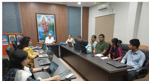
The first Academic Review meeting of Pragjyotishpur University was held on 10 August 2024.