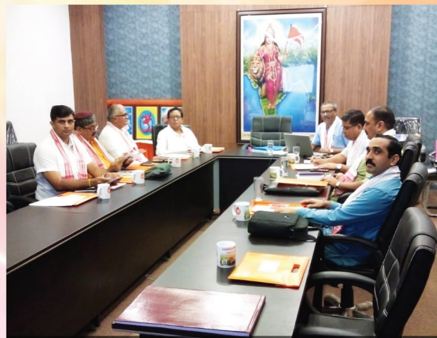
The first Board of Management meeting of Pragjyotishpur University was held on 17 June 2024.